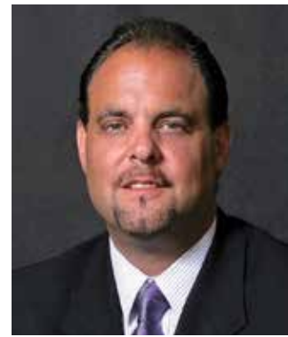
President RI Building & Construction Trades Council

As summer begins to turn to fall, it is that time again to join us in celebrating and supporting the good work of Big Brothers Big Sisters of the Ocean State (BBBSOS) at this year's annual fundraiser, the 10th Annual BIG Walk 'Halloween Hike' 5K Fun-Run . Come participate in a morning full of activities for the whole family to enjoy on Saturday, October 27, 2018 at the beautiful Carousel at Roger Williams Park in Providence. Registration is at 9am and walk time 10am rain or shine! Enjoy coffee, snacks, pizza, face painting, arts and crafts, prizes and much more. Don't forget to wear a costume, and kick off the Halloween Holiday while giving back to the community at the same time.